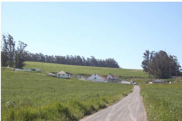
Spring Hill Cheese Company sits overlooking Two Rock Valley in Petaluma

Visit www.springhillcheese.com for more information, including stores where Springhill cheeses can be found.